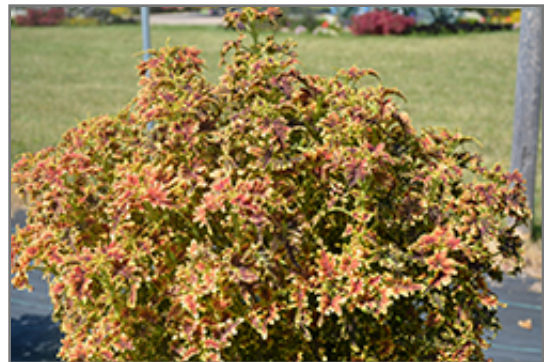
Under The Sea Copper Coral Coleus