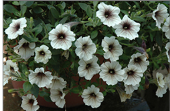
Supertunia Latte Petunia flowers