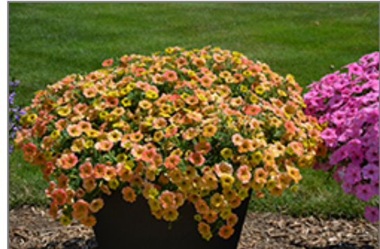
Supertunia Honey Petunia in bloom