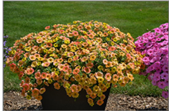
Supertunia Honey Petunia in bloom