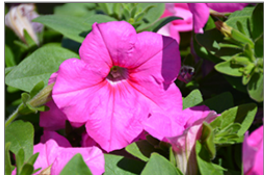
Easy Wave Pink Passion Petunia flowers

Easy Wave Pink Passion Petunia is recommended for the following landscape applications;