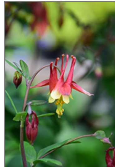
Wild Red Columbine flowers

Wild Red Columbine is recommended for the following landscape applications;