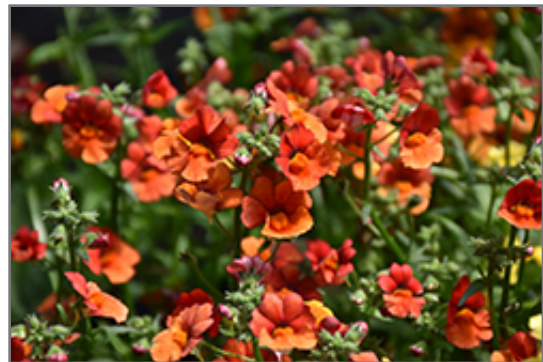
Sunsatia Blood Orange Nemesia flowers