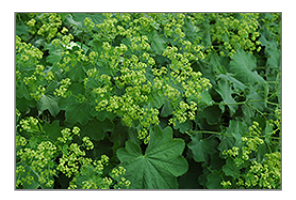
Lady's Mantle flowers

Lady's Mantle is recommended for the following landscape applications;