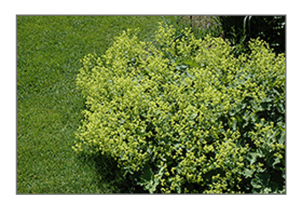
Lady's Mantle in bloom