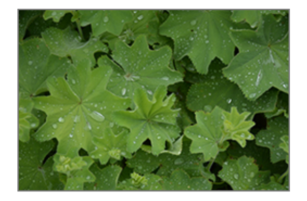
Lady's Mantle foliage

Lady's Mantle will grow to be about 18 inches tall at maturity, with a spread of 18 inches. Its foliage tends to remain dense right to the ground, not requiring facer plants in front. It grows at a medium rate, and under ideal conditions can be expected to live for approximately 10 years. As an herbaceous perennial, this plant will usually die back to the crown each winter, and will regrow from the base each spring. Be careful not to disturb the crown in late winter when it may not be readily seen!