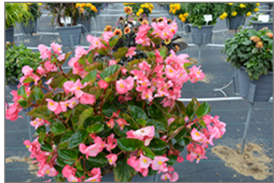
Big Pink Green Leaf Begonia in bloom

Big Pink Green Leaf Begonia is a fine choice for the garden, but it is also a good selection for planting in outdoor containers and hanging baskets. It is often used as a 'filler' in the 'spiller-thriller-filler' container combination, providing a mass of flowers and foliage against which the larger thriller plants stand out. Note that when growing plants in outdoor containers and baskets, they may require more frequent waterings than they would in the yard or garden.