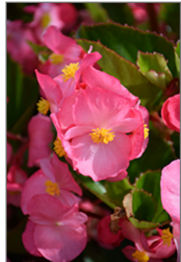
Big Pink Green Leaf Begonia flowers

This is a high maintenance plant that will require regular care and upkeep, and usually looks its best without pruning, although it will tolerate pruning. Deer don't particularly care for this plant and will usually leave it alone in favor of tastier treats. Gardeners should be aware of the following characteristic(s) that may warrant special consideration;