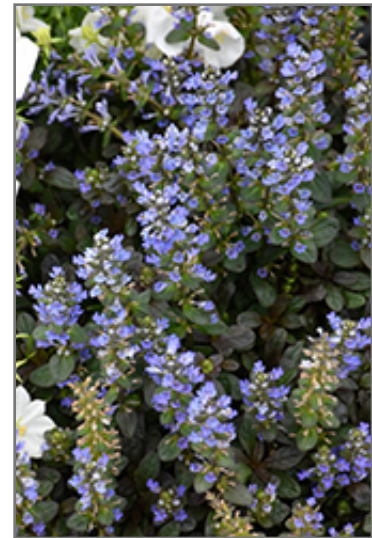
Chocolate Chip Bugleweed flowers

Chocolate Chip Bugleweed is recommended for the following landscape applications;