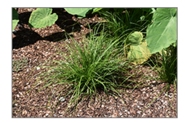
Cherokee Sedge

Slow spreading clumps of fine, narrow grasslike green leaves; a great look when massed along a moist border; perfect for low, wet spots or pondside, do not let it dry out