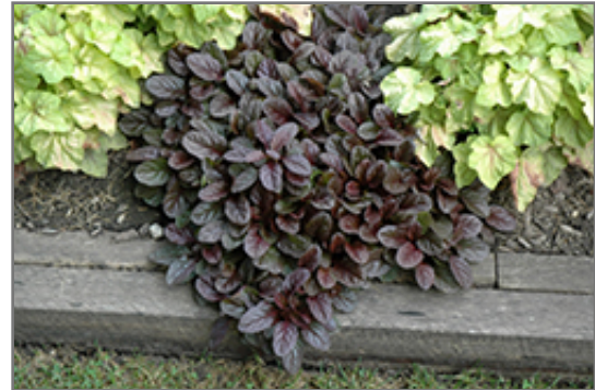
Mahogany Bugleweed