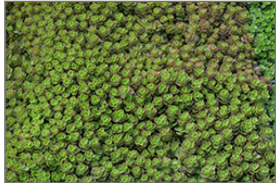
Dragon's Blood Stonecrop foliage