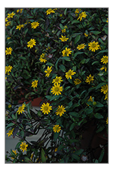
Show Yellow Creeping Zinnia flowers

Show Yellow Creeping Zinnia is covered in stunning yellow daisy flowers with gold eyes at the ends of the stems from late spring to mid fall. Its tomentose narrow leaves remain green in color throughout the season.