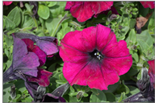
Easy Wave Burgundy Velour Petunia flowers