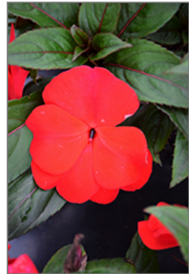
Divine Scarlet Bronze Leaf New Guinea Impatiens flowers

Divine Scarlet Bronze Leaf New Guinea Impatiens is recommended for the following landscape applications;