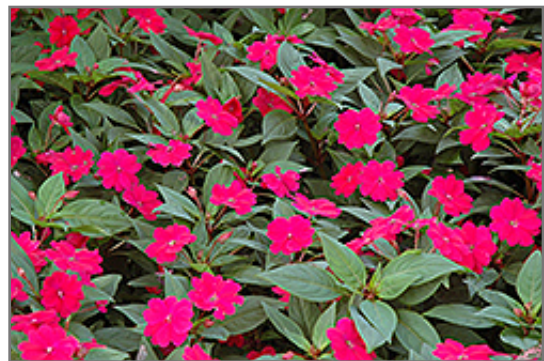
Bounce Cherry Impatiens in bloom