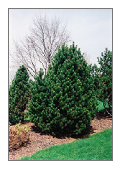
Gnom Mugo Pine

Gnom Mugo Pine will grow to be about 4 feet tall at maturity, with a spread of 5 feet. It tends to fill out right to the ground and therefore doesn't necessarily require facer plants in front. It grows at a slow rate, and under ideal conditions can be expected to live for 50 years or more.