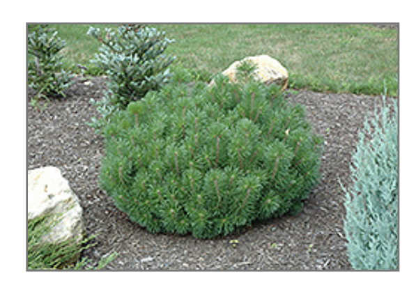
Enci Mugo Pine

An upright and spreading evergreen shrub which eventually becomes wider than high, rich green needles, forms a dense mound of upright branches, far more compact than the species; great in mass or used as a tall groundcover, very adaptable and tough