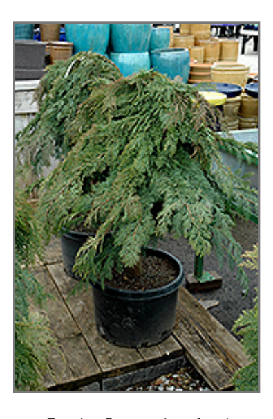
Russian Cypress (tree form)

Russian Cypress (tree form) will grow to be about 3 feet tall at maturity, with a spread of 4 feet. It tends to be a little leggy, with a typical clearance of 1 foot from the ground. It grows at a slow rate, and under ideal conditions can be expected to live for approximately 30 years.