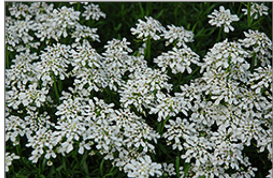
Little Gem Candytuft flowers