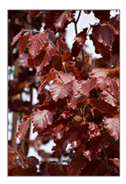
Red Obelisk Beech foliage