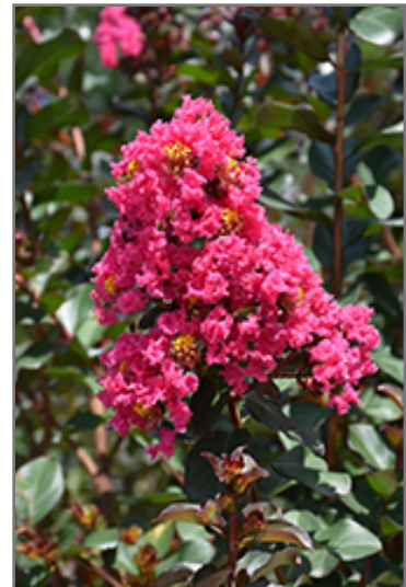
Pink Velour Crapemyrtle flowers