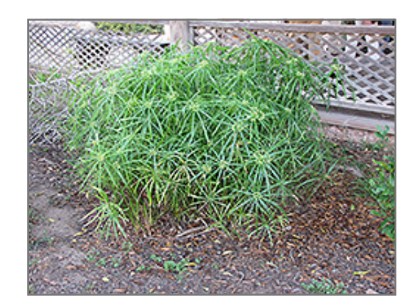
Umbrella Plant

This variety is a semi-aquatic, grass-like plant producing a mound of green stems with green bracts; perfect for pond side planting or in wet areas of the garden; will tolerat drier conditions once established