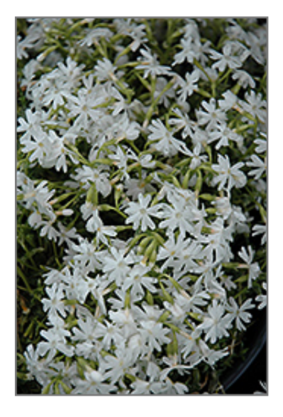
Snowflake Phlox flowers

This variety produces a showy carpet of bright white flowers shining in the spring sun; prune lightly after flowering to encourage a dense growth habit; wonderful for rock gardens, edging, or in mixed containers