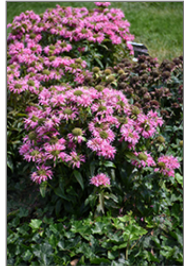
Pardon My Pink Beebalm in bloom