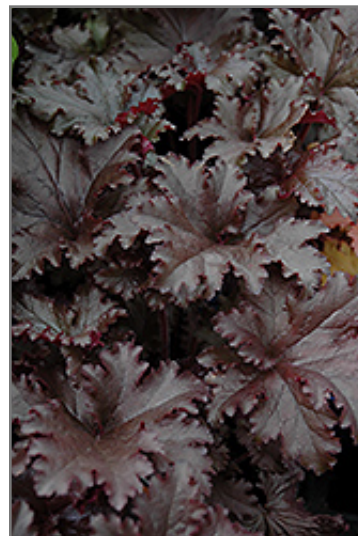
Black Taffeta Coral Bells foliage

Black Taffeta Coral Bells is recommended for the following landscape applications;