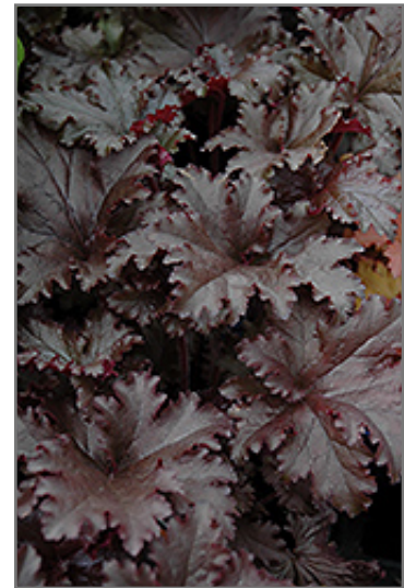
Black Taffeta Coral Bells foliage

Black Taffeta Coral Bells is recommended for the following landscape applications;