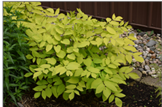
Sun King Japanese Spikenard