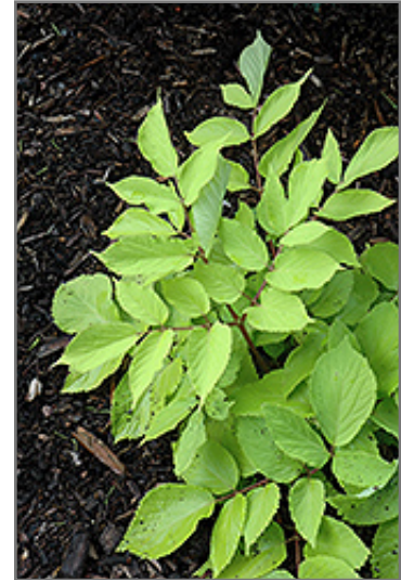
Sun King Japanese Spikenard foliage

This plant performs well in both full sun and full shade. It prefers to grow in average to moist conditions, and shouldn't be allowed to dry out. It is not particular as to soil type or pH. It is highly tolerant of urban pollution and will even thrive in inner city environments. This is a selected variety of a species not originally from North America.