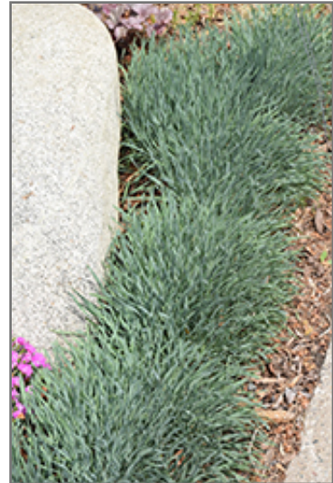
Blue Eddy Ornamental Onion