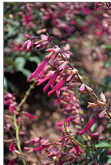
Wendy's Wish Sage flowers

Wendy's Wish Sage is recommended for the following landscape applications;