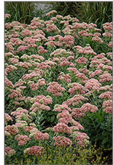
Autumn Joy Stonecrop in bloom

Autumn Joy Stonecrop is recommended for the following landscape applications;