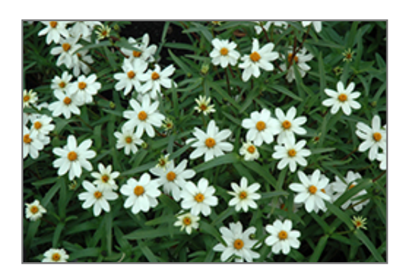
Star White Zinnia

Star White Zinnia is bathed in stunning white daisy flowers with gold eyes at the ends of the stems from late spring to late summer. The flowers are excellent for cutting. Its narrow leaves remain emerald green in color throughout the season.