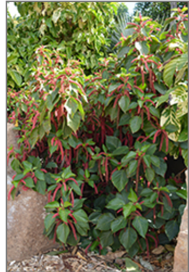
Firetail Chenille Plant in bloom