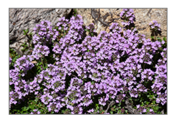
Purple Carpet Creeping Thyme flowers