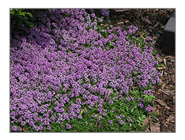
Purple Carpet Creeping Thyme in bloom