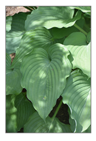
Komodo Dragon Hosta foliage

Komodo Dragon Hosta is recommended for the following landscape applications;