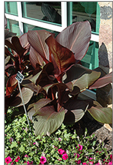
Tropicanna Black Canna

This plant should only be grown in full sunlight. It prefers to grow in moist to wet soil, and will even tolerate some standing water. It is not particular as to soil type or pH. It is highly tolerant of urban pollution and will even thrive in inner city environments. Consider applying a thick mulch around the root zone in winter to protect it in exposed locations or colder microclimates. This particular variety is an interspecific hybrid. It can be propagated by division; however, as a cultivated variety, be aware that it may be subject to certain restrictions or prohibitions on propagation.