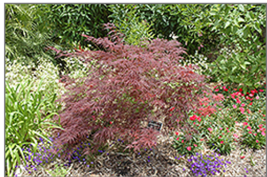
Dissectum Nigrum Cutleaf Japanese Maple