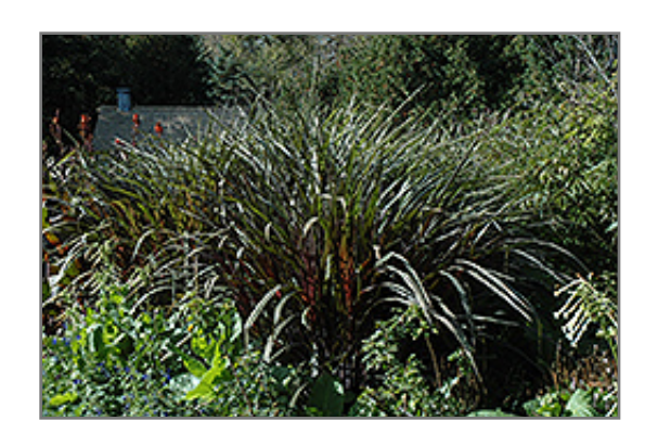
Prince Fountain Grass