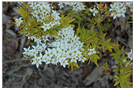
Mellow Yellow Spirea flowers