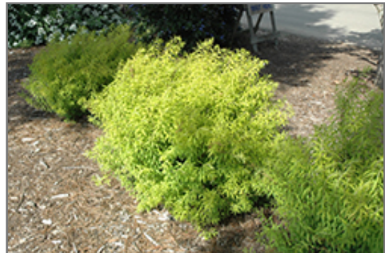
Mellow Yellow Spirea

Mellow Yellow Spirea is recommended for the following landscape applications;