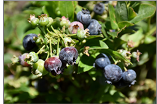
Jelly Bean Blueberry fruit