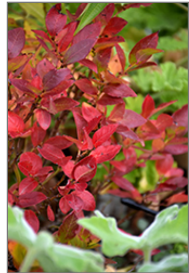
Jelly Bean Blueberry in fall

Jelly Bean Blueberry features dainty clusters of white bell-shaped flowers with shell pink overtones hanging below the branches in mid spring. It has red-variegated green foliage. The glossy oval leaves turn an outstanding red in the fall. It features an abundance of magnificent blue berries in mid summer.