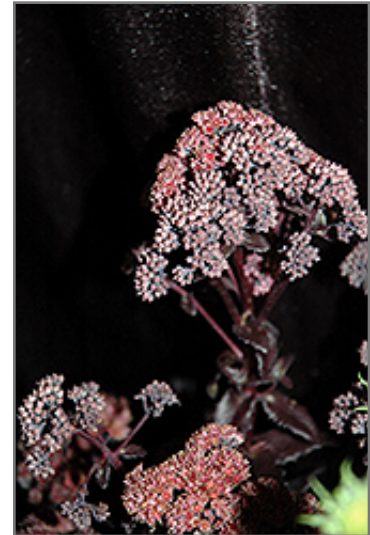
Orbit Bronze Stonecrop flowers