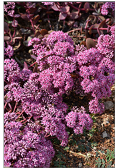
Cherry Tart Stonecrop flowers

Cherry Tart Stonecrop is a fine choice for the garden, but it is also a good selection for planting in outdoor pots and containers. It is often used as a 'filler' in the 'spiller-thriller-filler' container combination, providing a mass of flowers and foliage against which the larger thriller plants stand out. Note that when growing plants in outdoor containers and baskets, they may require more frequent waterings than they would in the yard or garden.