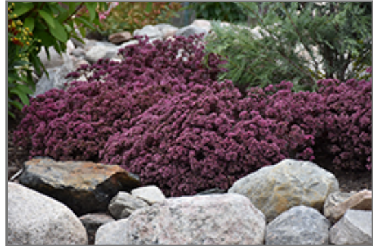
Cherry Tart Stonecrop in bloom

Cherry Tart Stonecrop is a dense herbaceous perennial with an upright spreading habit of growth. Its medium texture blends into the garden, but can always be balanced by a couple of finer or coarser plants for an effective composition.