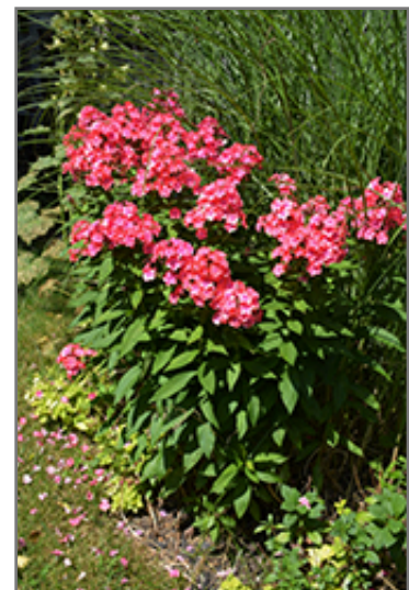
Flame Coral Garden Phlox in bloom