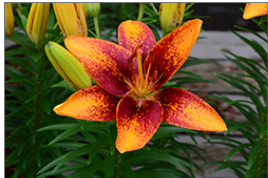
Lily Looks Tiny Orange Sensation Lily flowers