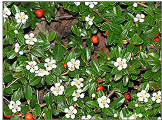
Coral Beauty Cotoneaster fruit

Coral Beauty Cotoneaster will grow to be about 12 inches tall at maturity, with a spread of 5 feet. It tends to fill out right to the ground and therefore doesn't necessarily require facer plants in front. It grows at a fast rate, and under ideal conditions can be expected to live for approximately 30 years.