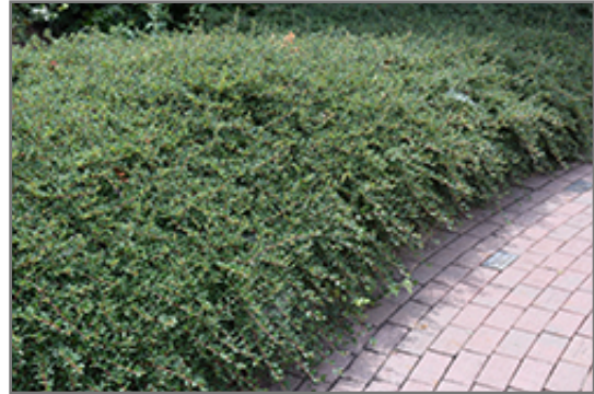
Coral Beauty Cotoneaster