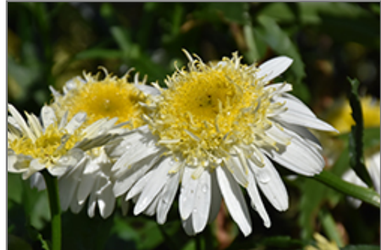
Realflor Real Glory Shasta Daisy flowers

Realflor Real Glory Shasta Daisy is recommended for the following landscape applications;