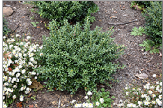
Soft Touch Japanese Holly