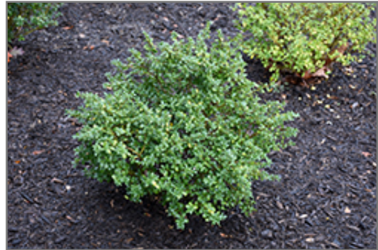
Green Lustre Japanese Holly