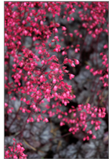
Glitter Coral Bells flowers

Glitter Coral Bells will grow to be about 10 inches tall at maturity extending to 16 inches tall with the flowers, with a spread of 14 inches. When grown in masses or used as a bedding plant, individual plants should be spaced approximately 12 inches apart. Its foliage tends to remain low and dense right to the ground. It grows at a medium rate, and under ideal conditions can be expected to live for approximately 10 years. As an evergreen perennial, this plant will typically keep its form and foliage year-round.