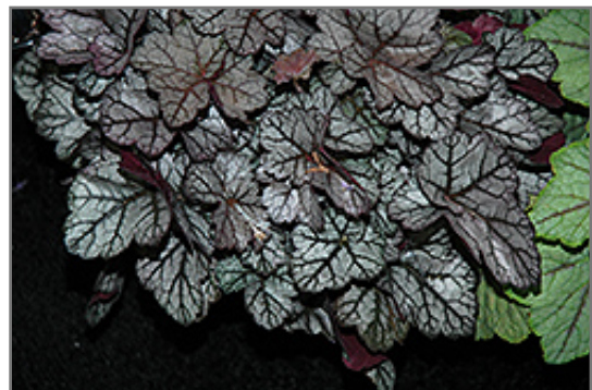
Glitter Coral Bells foliage