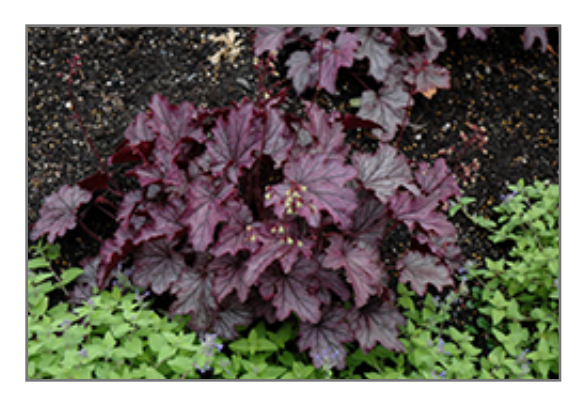
Spellbound Coral Bells

This is a relatively low maintenance plant, and should be cut back in late fall in preparation for winter. It is a good choice for attracting hummingbirds to your yard. It has no significant negative characteristics.