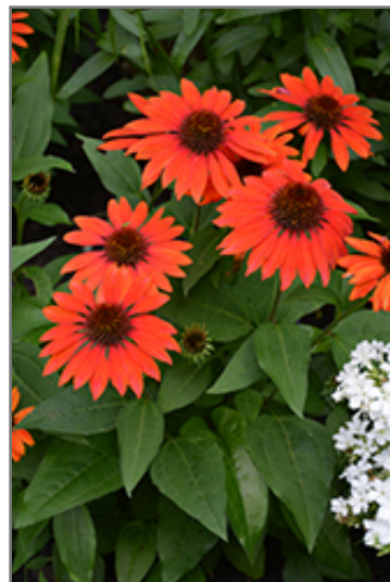
Sombbrero Flamenco Orange Coneflower in bloom

Sombbrero Flamenco Orange Coneflower is recommended for the following landscape applications;